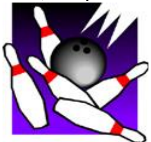
Fall Harvest Bowling Party" at the Madison Park Bowl, Madison Heights, MI.

On Saturday, October 27, Tau Kappa Kappa sponsored its second annual, "Family & Friends